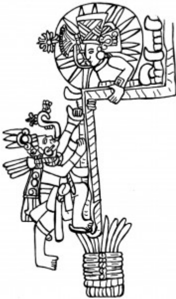
Figure 7: Monument from El Castillo, Cotzumalhuapa region, Guatemala (drawing by D. Wirth)

The man is climbing what appears to be a rope, but in actuality this motif is the edge of an open-mouthed reptilian monster, whose teeth act as stairs. The deity sitting above in the opened mouth is most definitely the sun, as is determined by the sunburst around him. These monuments are considered to be done in a narrative style, like Stela 5, referred to as the “Tree of Life” stone by some Latter-day Saints, at Izapa, Chiapas, Mexico, 37 which contains no hieroglyphic text giving a clue to the monument’s intended message. They simply tell a story in picture form.