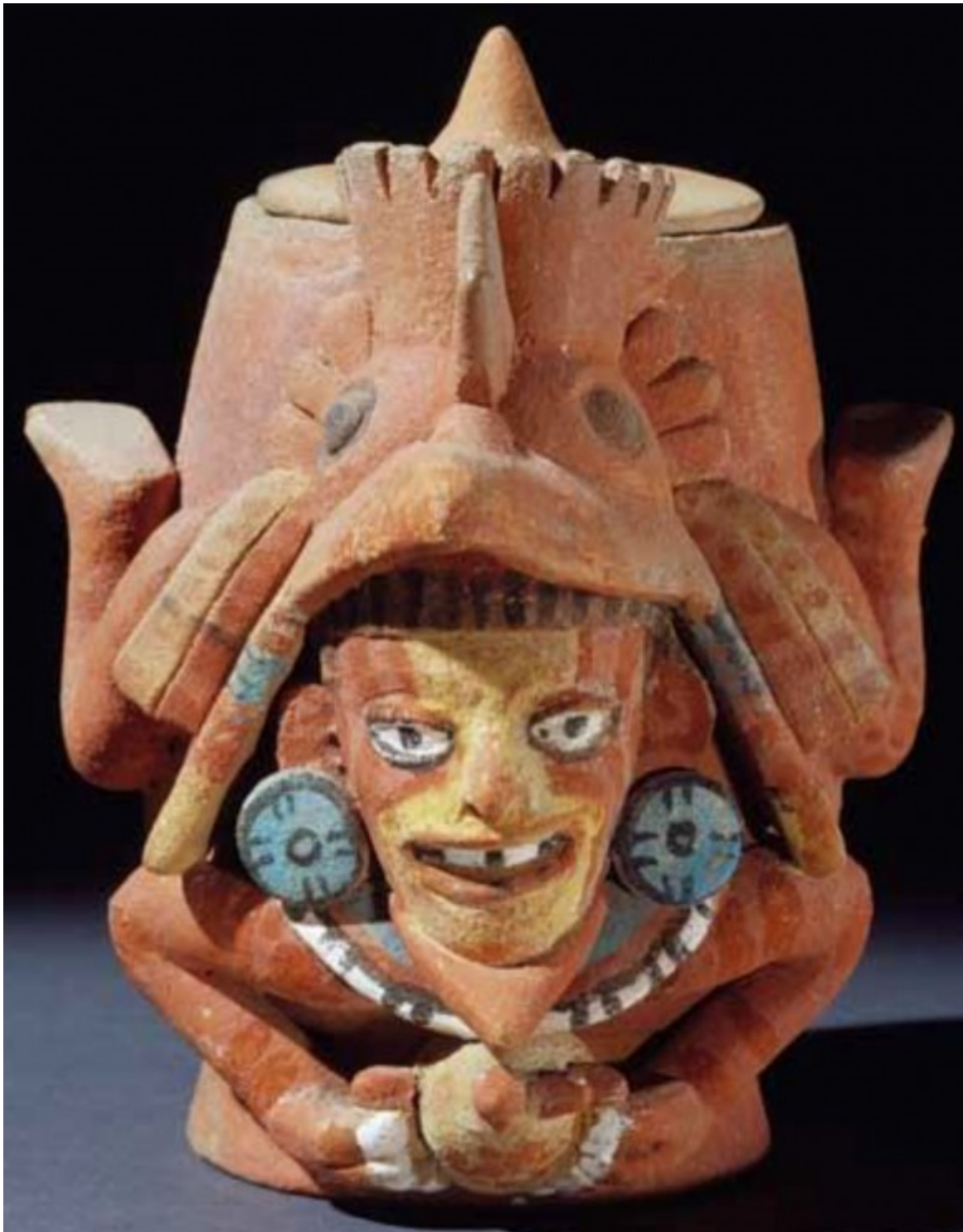
Figure 9: Ceramic diving god container wearing a bird headdress, housed at the U.S. Library of Congress

[Page 73]Most have a bird headdress, representative of their high god. The answer as to who this god may represent is varied: The Maize God, Itzamna, or Quetzalcoatl. We do not really know. Such depictions of a deity descending are associated with sacrifice; however, many of them have been interpreted as a symbol of the sun, fertility, and maize. 38