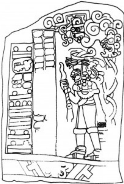
Figure 3: Stela 1 at El Baúl, Cotzumalhuapa region, Guatemala (drawing by D. Wirth)

The S-shaped scroll was used as a glyph for the word muyal , meaning “cloud” in Classic Mayan texts, and is a metaphor for the heavens. 16