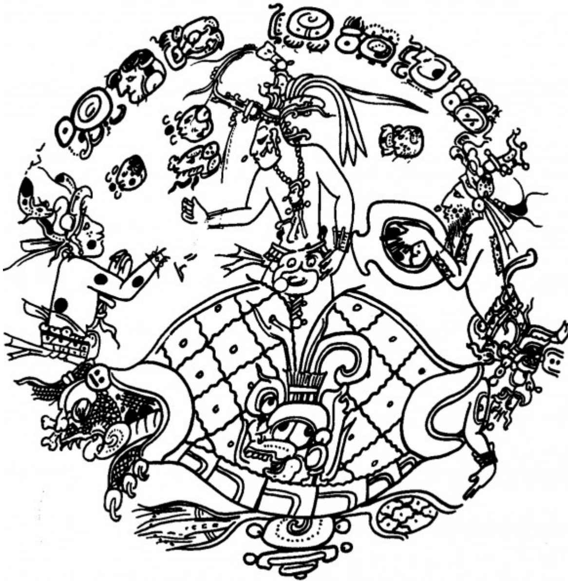
Figure 6: The resurrection of Hun Nal Ye, the Maize God, from a turtle carapace, painted on a Maya vessel