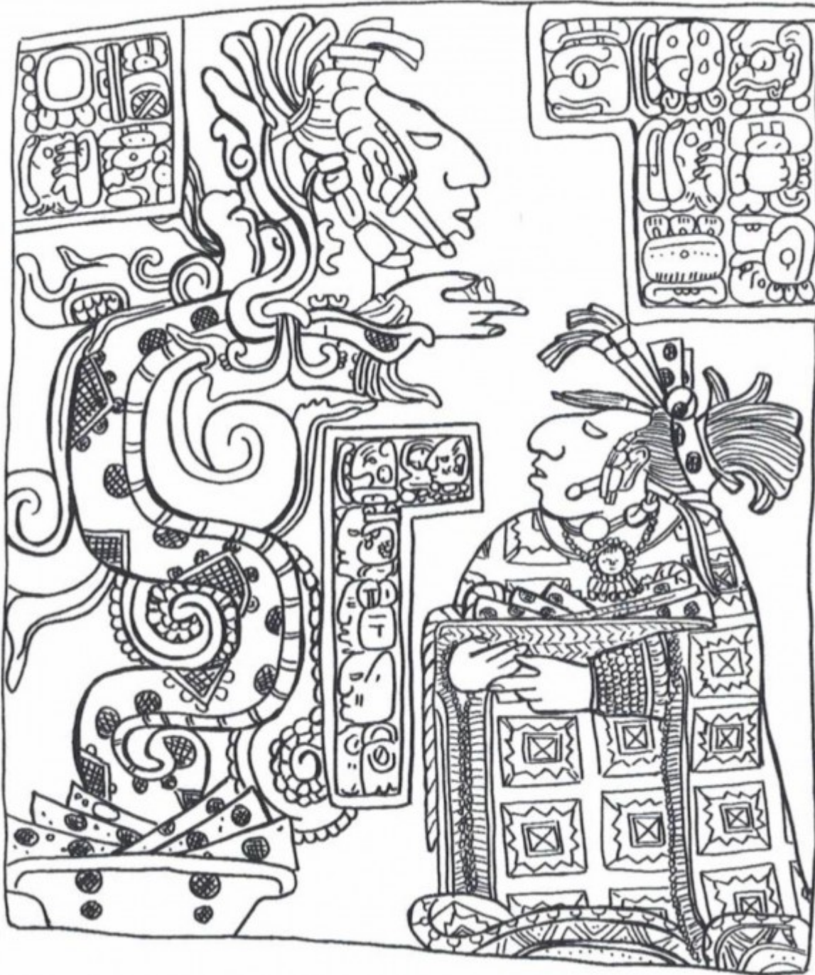
Figure 5: Lintel 15 at Yaxchilan, Chiapas, Mexico (drawing by D. Wirth)

Today, however, there is no vestige of the Vision Serpent among the Maya. 25 Whether or not the Vision Serpent was associated with the Feathered Serpent, Quetzalcoatl, is debatable. Miller and Taube postulate a smoky cloud cross-hatching pattern flanks many Vision Serpents' bodies, and it is known that the serpent is sometimes seen in art as the Sky Serpent. 26 The word for serpent and sky in Mayan sound very similar with a slight phonetic variation: sky caan , and serpent can . In other words, the Vision Serpent was a direct link to heavenly clouds [Page 68] and visions, rather than feathers of the plumed serpent, representing Quetzalcoatl. 27