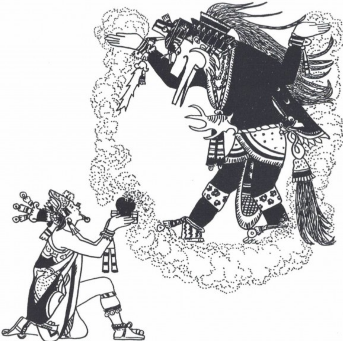
Figure 4: Montezuma using incense clouds to conjure the deity Ehecatl-Quetzalcoatl (drawing by D. Wirth)

Mesoamerican people performed rituals that in our eyes mimicked the aforementioned visions of Lehi's descendants. These practices were thought to bring sacred supernatural beings into their presence. From the earliest times in many parts of the Maya region, the serpent was a symbol of the vision rite 24 and was sometimes associated with clouds. In illustrations of Vision Serpents, the serpent has an opened mouth [Page 67]bringing forth a supernatural deity, which is often a deceased ancestor, into the land of the living.