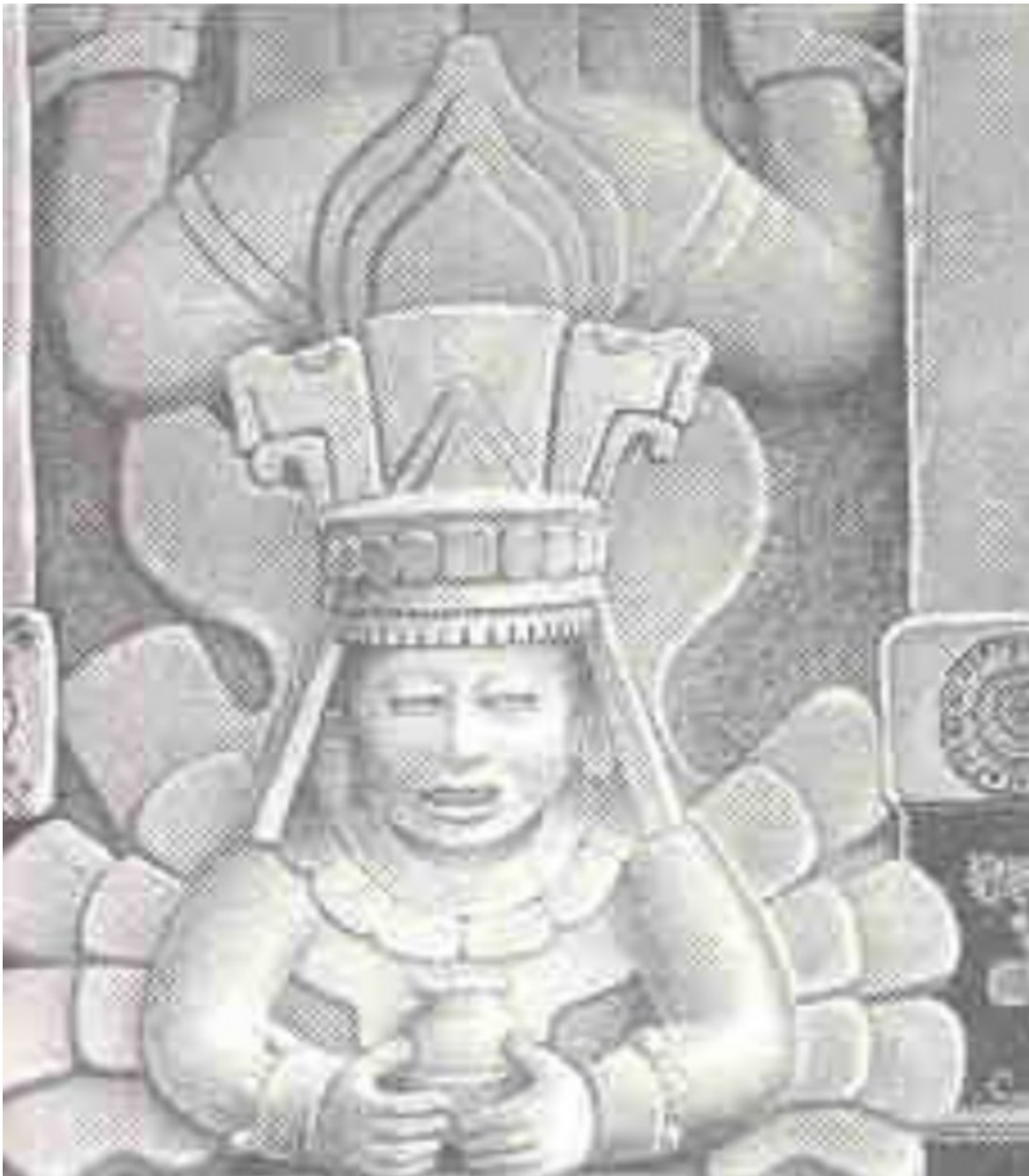
Figure 8: Descending god from Mural 2, Structure 16 at Tulum, Yucatan, Mexico (drawn by Felipe Dávalos)

Some LDS tour guides say this is evidence of Christ's visit to Mesoamerica, which may be a bit presumptuous, since we simply do not have concrete evidence for this assumption as stated earlier. However, we have to wonder if these depictions of descending gods may derive from a long-held tradition of supernatural beings visiting earth.